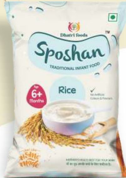
Net. Wt. 50gm

Best Before 9 months from the date of Manufacturing.