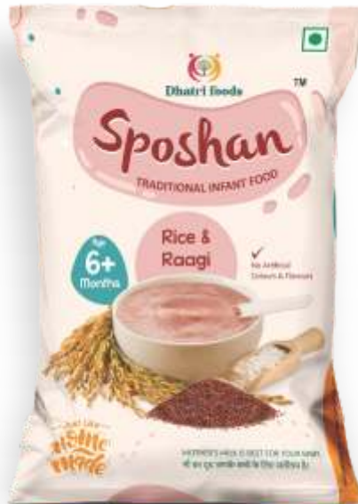
Net. Wt. 50gm