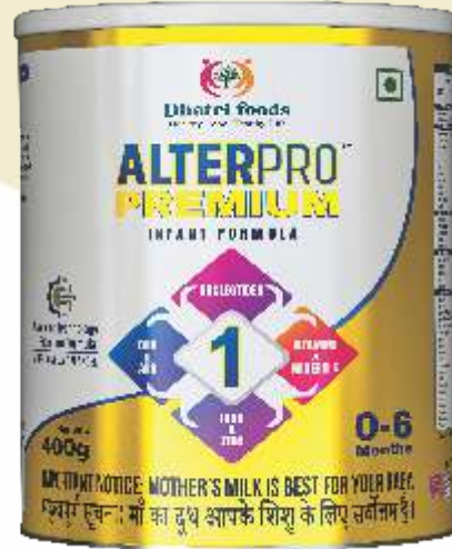
ALTERPRO PREMIUM STAGE-2 400 GRAM