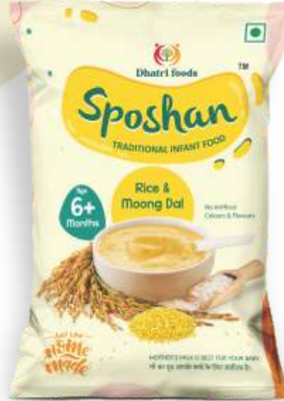
Net. Wt. 50gm