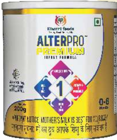
ALTERPRO PREMIUM STAGE-1 200 GRAM