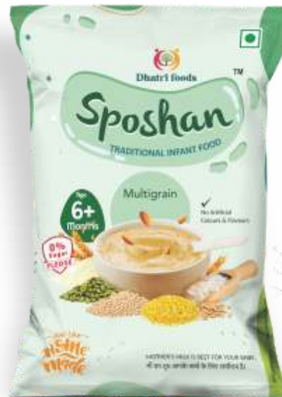
Net. Wt. 50gm

These Little pouches are made for comfortable approachable & easily accessible to all our beloved customers