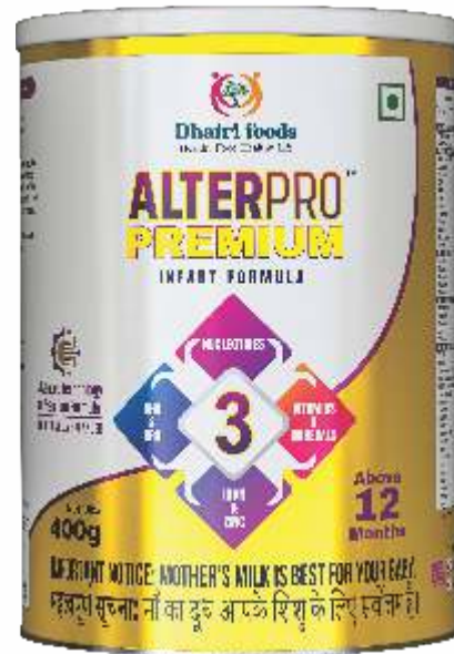
ALTERPRO PREMIUM STAGE-3 400 GRAM